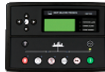
DSE7320 Remote Control Panel